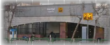
Tohid Metro Station (E4), and tunnel of Line 4 - Tehran